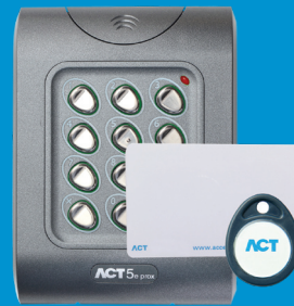
ACT 5e prox Digital Keypad & Proximity