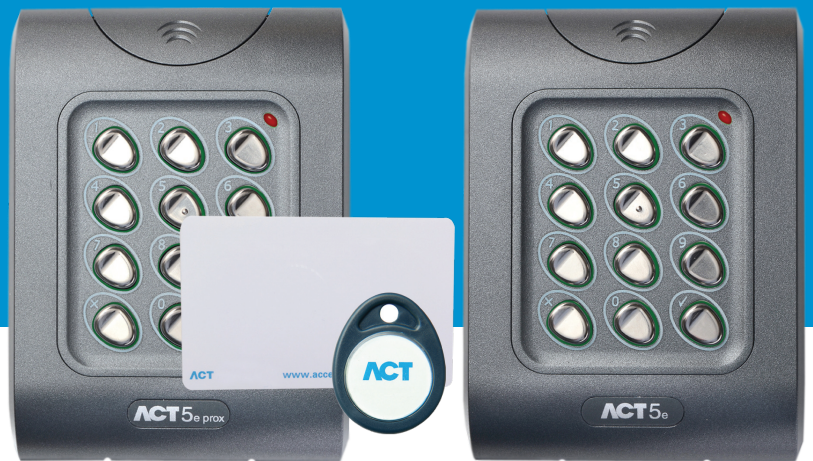
ACT 5e prox Digital Keypad & Proximity

Each keypad is contained in a stylish polycarbonate housing, with stainless steel keys and potted electronics, allowing for indoor and outdoor installation.